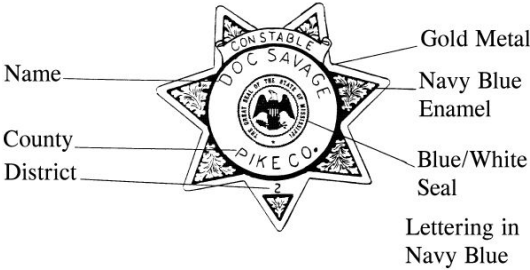
Figure 2 Badge